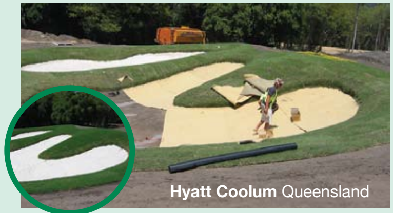
Hyatt Coolum Queensland

BunkerMat®s tight knit UV stabilised fibres ensures a first quality bunker liner.