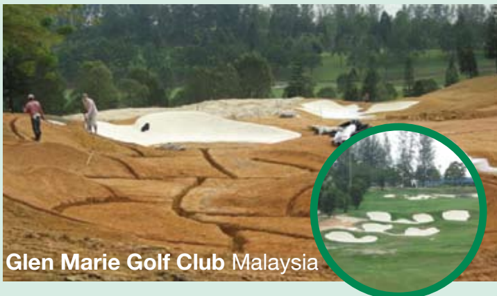
Glen Marie Golf Club Malaysia